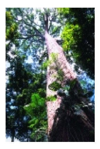
Mahogany tree in the Amazon forest, Brasil

"The EU currently launders large volumes of illegally sourced timber each year."