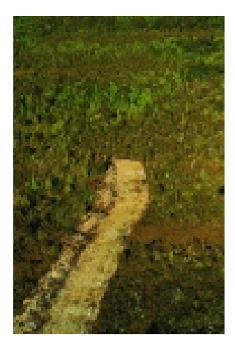
A road is being run into the forests of Chiloe Island