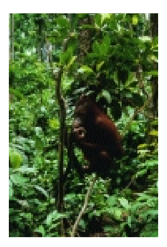
Illegal and destructive logging threaten the survival of the world's last orangutans.