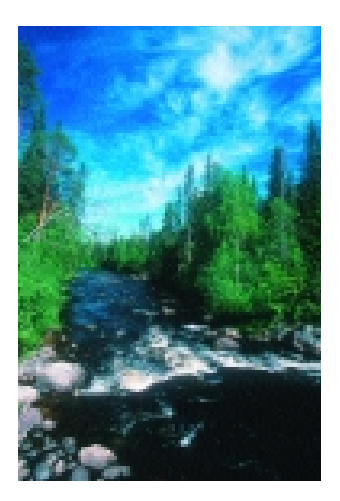
View of Kostomuksha district.