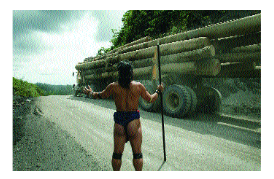
Malaysia, Penan man standing next to a Shin Yang Timber passing truck loaded with logs.

There is a clear danger that the EU's efforts to curb illegal logging will unwittingly encourage national governments to water-down their existing environmental laws rather than strengthening them. This could lead to weakening existing forest laws, or even to legalising current illegal practices, in order to satisfy the EU and other international markets. The challenge, therefore, is to ensure that the illegal logging debate is not focused on legality at the risk of encouraging destructive logging practices. It is therefore essential to start a political dialogue with producer countries focused on forest sector reform, increasing transparency, strengthening land tenure and access rights, and reducing corruption. This will not only address the illegal forestry practices but also lead to forest sector reform which is, in many cases, desperately needed to halt destructive logging.