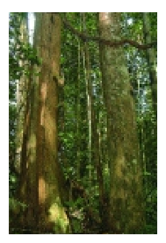
Primary forest in Indonesia