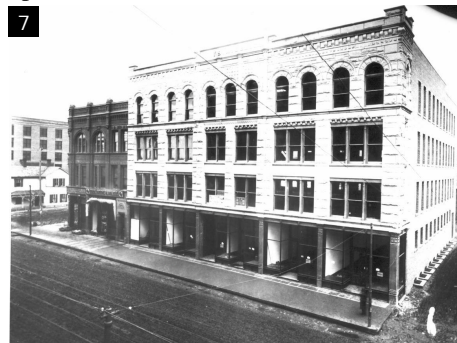
Northeast corner 4 th and Court Streets