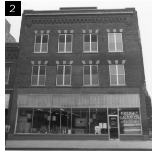
Southwest side of the street