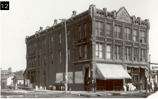
Northeast corner 4 th and Iowa Streets