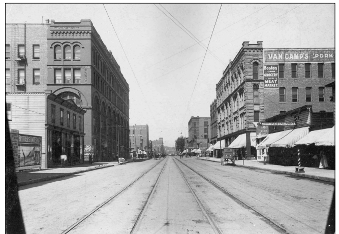
Looking west on 4 th Street from Iowa Street, c. 1898