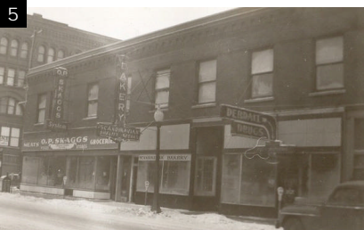
Southwest corner of 4th and Court Streets