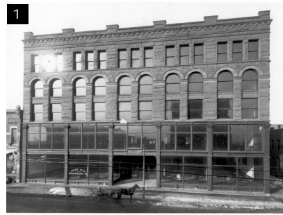
Northwest side of the street

Start the tour at the northwest corner of 4 th and Virginia streets walking east along 4 th Street to Iowa Street.