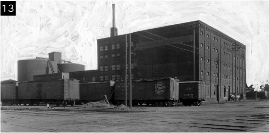
Northeast corner 2 nd and Court Street