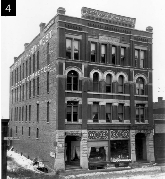
Middle of the south side of the street

Buildings listed in italics> are no longer in existence.