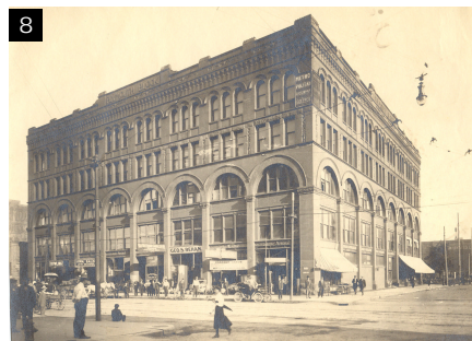
Southeast corner 4 th and Court Streets