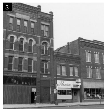
Middle of the south side of the street

This building was constructed around 1905 as a two-story structure. A third story was added sometime after 1919. Morris Levich operated a furniture store at this location from 1908 to 1924. Later it housed a radio store, an auction house, a series of used furniture dealers and the Freight Sales Company. Local artist Paul Chelstad painted the mural on the west side of the building in 2003.