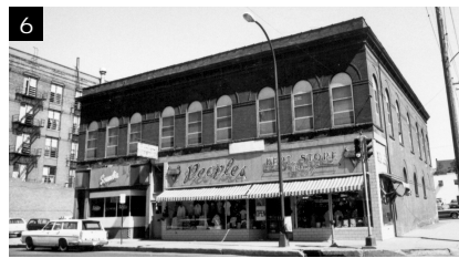
Northwest corner 4 th and Court Streets