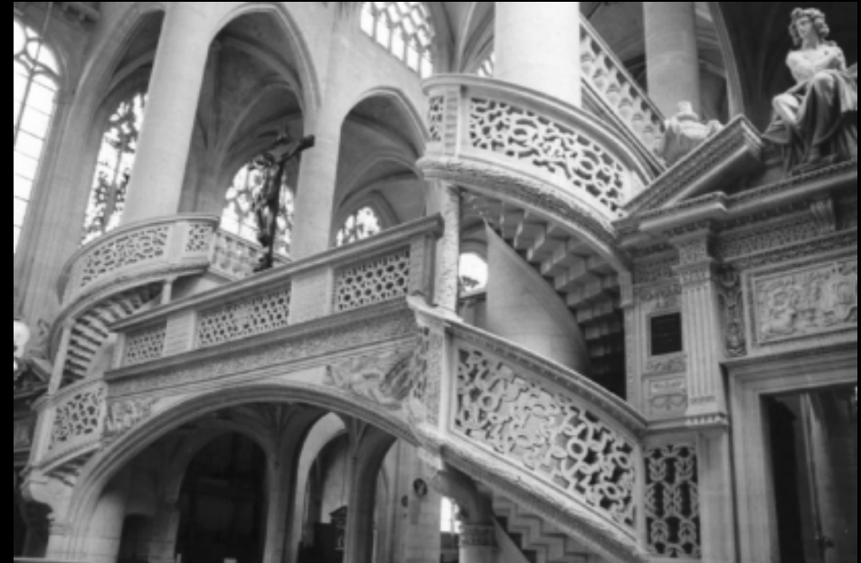
Durufle's church, St Etienne du Mont, Paris