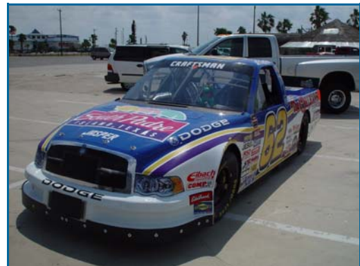
#62, The Orleans Dodge