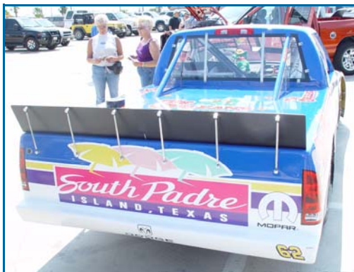
The South Padre Island Logo