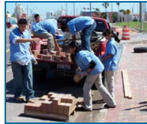
Success Center Kids Working On Project