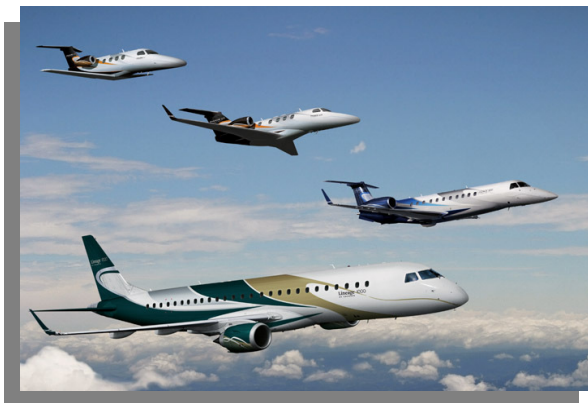
Embraer executive jets portfolio

The Lineage 1000 is powered by two efficient, reliable and easy-to-maintain GE CF34-10E7 engines, with 18,500 pounds of thrust each. Its range with eight passengers onboard will be 4,200 nautical miles (7,778 km or 4,833 miles) with NBAA IFR reserves and 200 nm alternate. The airplane has a great airport performance, maximum operating speed of Mach 0.82, and is capable of flying at 41,000 feet (12,497 m).