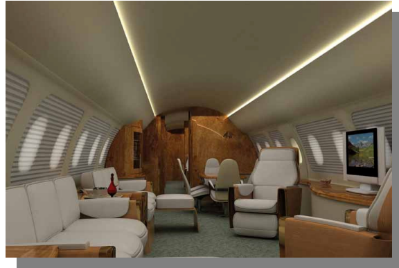
Lineage 1000 interior

The Lineage 1000 offers the flexibility of interior customizations with the possibility of up to three lavatories and even a stand-up shower. The airplane's generous baggage compartment is complemented by a walk-in luggage area conveniently accessible in flight. The distinctive luxury of the Lineage 1000 combined with prime engineering – featuring fly-by-wire technology – will offer a superior travel experience.