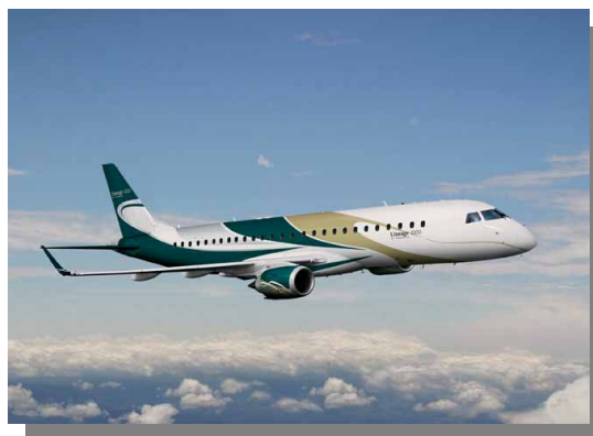
The Lineage 1000