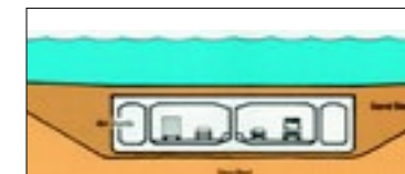
Cross section of the submerged tunnel

The Sydney Harbour Tunnel proposal by Transfield/Kumagai Gumi Joint Venture was adopted by Parliament in 1987, with Sydney-based consulting engineers Wargon Chapman Partners appointed as Design Managers. Construction began in January 1989 and the tunnel was opened on 31 August 1992. The total 2.3km project cost $560 million.