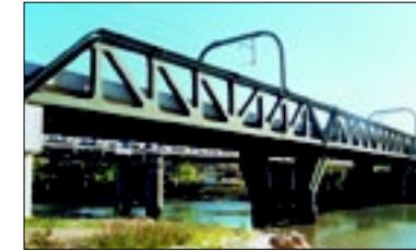
The Camellia Railway Bridge

It is welded steel truss and is the latest bridge, 1995, over the river.