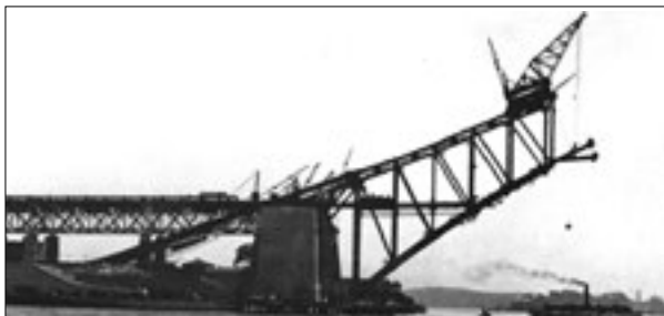
The Harbour Bridge being constructed, October 1929

This location, where Harbour becomes River and the waterway is only 500m wide, was the site for the earliest crossing: a rowing boat service. A cable-guided steam paddle punt took over in 1842 and continued until 1932, and one of the loading docks can be seen on the eastern side of Dawes Point.