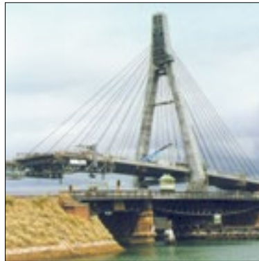
The Anzac Bridge during construction and the 1903 Glebe Island swing bridge, in 1994

Pyrmont Bridge can be reached by walking from the city down Market Street, Anzac Bridge can be reached by a 500 series bus.