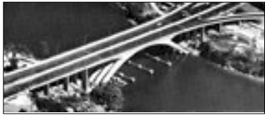
Tarban Creek Bridge

Gladesville Bridge is in fact four arch ribs side by side—look up as you pass under the bridge.