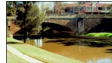
The Lennox Bridge

David Lennox was the great stone arch bridge builder in the 1830s and 40s. Completed in 1839 to carry Church Street, this is the oldest bridge on the tour. The downstream half is original construction with concrete widenings of 1912 and 1935 on the upstream side.