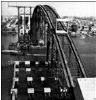
Hollow concrete box units being assembled to construct the Gladesville Bridge

Each rib was assembled from precast hollow concrete boxes on falsework right across the river. When a rib was made self-supporting it lifted off the falsework which was then moved sideways for the next rib and so on. The traffic deck is a series of prestressed concrete girders on slender reinforced concrete columns. At completion in 1964 this bridge was the largest concrete arch in the world with a span of 305m. It contains 50,000 tonnes of concrete and has a clearance of 37m above high tide.