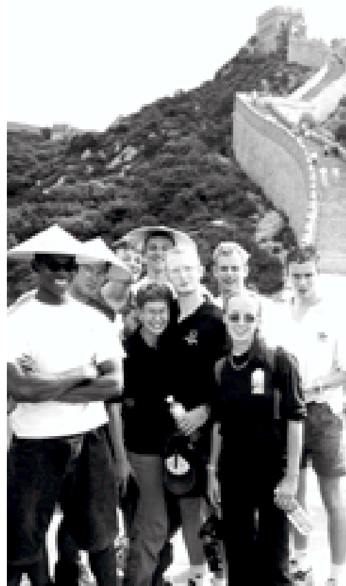
Achilles at the Great Wall of China