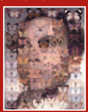
Image: Fiona MacDonald Five Paces 1989, collage of photo-offset images. Gift of Peter Fay 2002. Courtesy of Mori Gallery. National Gallery of Australia, Canberra.

A watercolour workshop to learn or perfect their technique on botanical subjects.