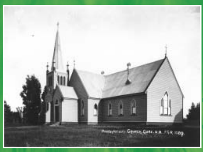
Image: East Gore Presbyterian Church, New Zealand - artist in residence facilities.