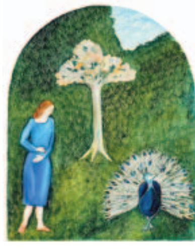
Image: Vivienne Shark LeWitt, ZugzWang 1985, oil on canvas, 36 x 29cm, Museum of Contemporary Art, Gift of Loti Smorgan & Victor Smorgan 1995.

and collecting. It is about risk-taking and, above all, being open to the adventure of art as something dynamic and alive.