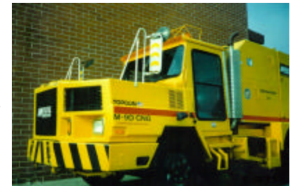
CNG street sweepers like the one above keep both our streets and air clean

The funding includes a grant of $29,032 for the purchase of videoconferencing equipment for the Bureau of Sanitation. This equipment will facilitate less City vehicle use by City staff who will be able to attend meetings and conferences via video rather than by traveling in a car to and from meeting sites. Another grant for $40,000 to purchase one liquefied gas refuse collection truck and one compressed natural gas (CNG) street sweeper for Los Angeles World Airports will help to mitigate vehicle emissions from maintenance vehicles being used at our City's air-