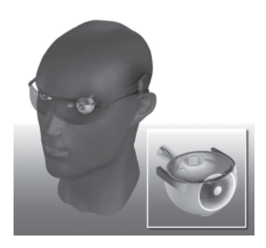
Fig. 2. Schematic representation of the Second Sight TM, Model 1 Intraocular Retinal Prosthesis (IRP) apparatus, including camera, connector cable and microelectrode array.

This group used a series of psychophysical experiments to study several of the fundamental questions regarding the elicitation of visual perception that the IRP group had attempted to answer in their animal and human studies. Would blind subjects report a single percept after stimulation of a single electrode at or slightly above threshold? Could