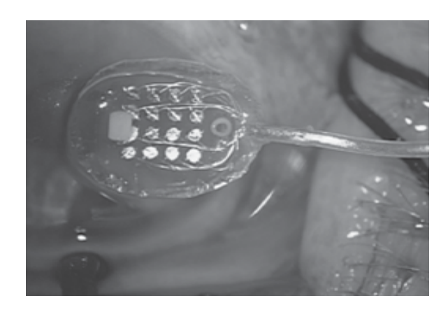
Fig. 4. Photograph of the Second Sight Model 1 epiretinal microelectrode array prior to insertion into the vitreous cavity in a patient with longstanding retinitis pigmentosa.

pattern vision be achieved when multielectrode stimulation was given? When stimulating the same electrode at different times, would the percept seen be the same?