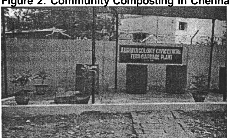
Figure 2: Community Composting in Chennai

Figure 2, below, depicts the composting activities of Civic Exnora in Akshaya Colony, Chennai.<sup>6</sup>