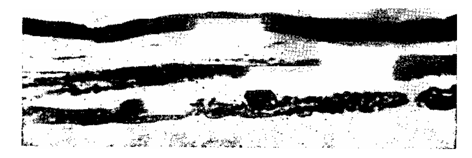
Fig 1. Demyelination. LFB PASX600.

In the human, demyelination often of a segmental type could clearly be demonstrated (Fig 1). In addition areas of what appeared to be remyelination