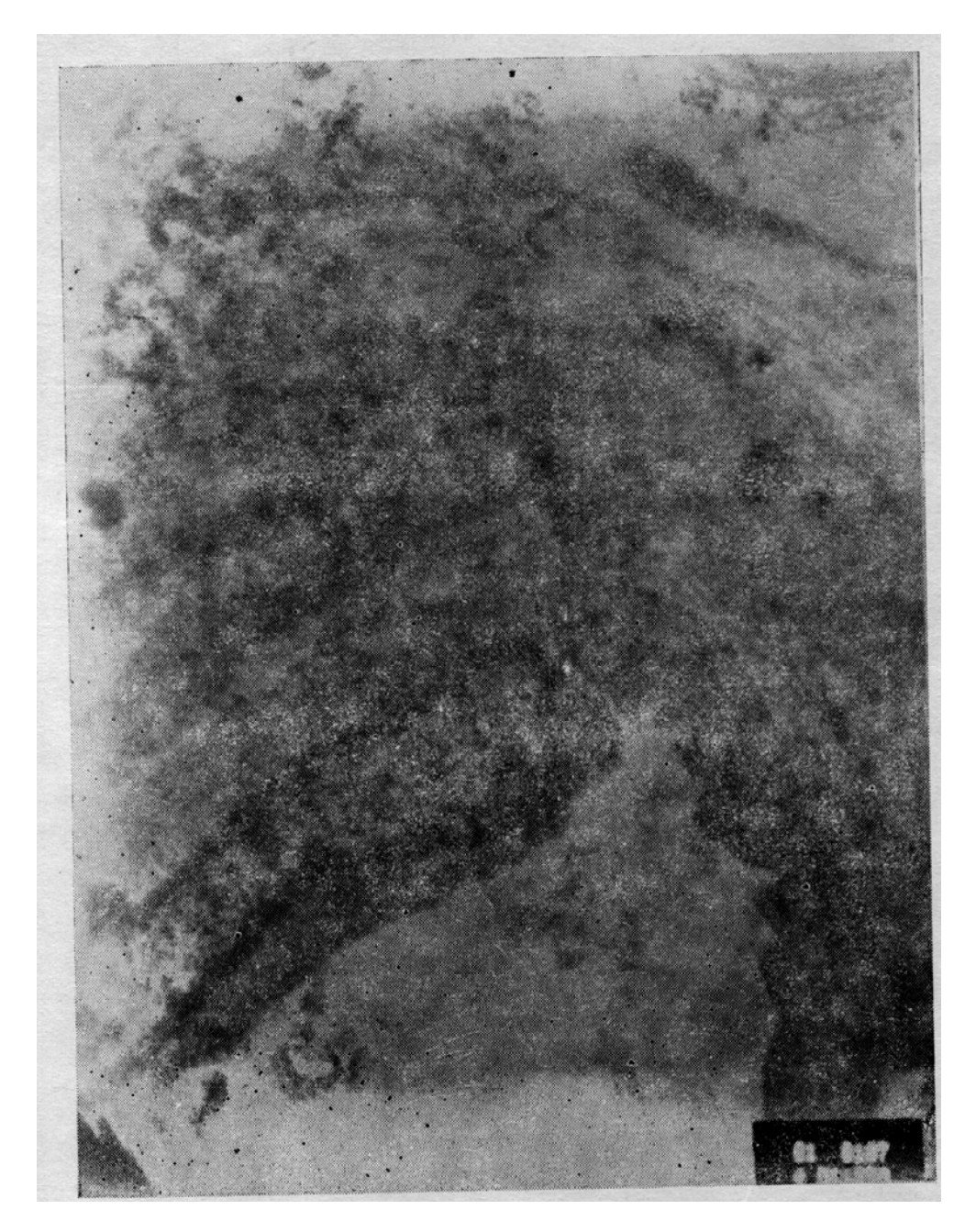
Fig 6. Blood vessel with reduplicated basement membrane material X 8800

The axons showed a number of changes. Many appeared swollen with ballooned appearance, seen in both longitudinal and cross sections. There appeared to be a variable increase in the number of neurofilaments, microtubules, dense bodies, vesciles and mitochondria. In others, there was granular degeneration of the tubules and filaments. In the early cases, large accumulations of electron dense granular material-glycogen? sorbitol was seen (Fig 5). Later