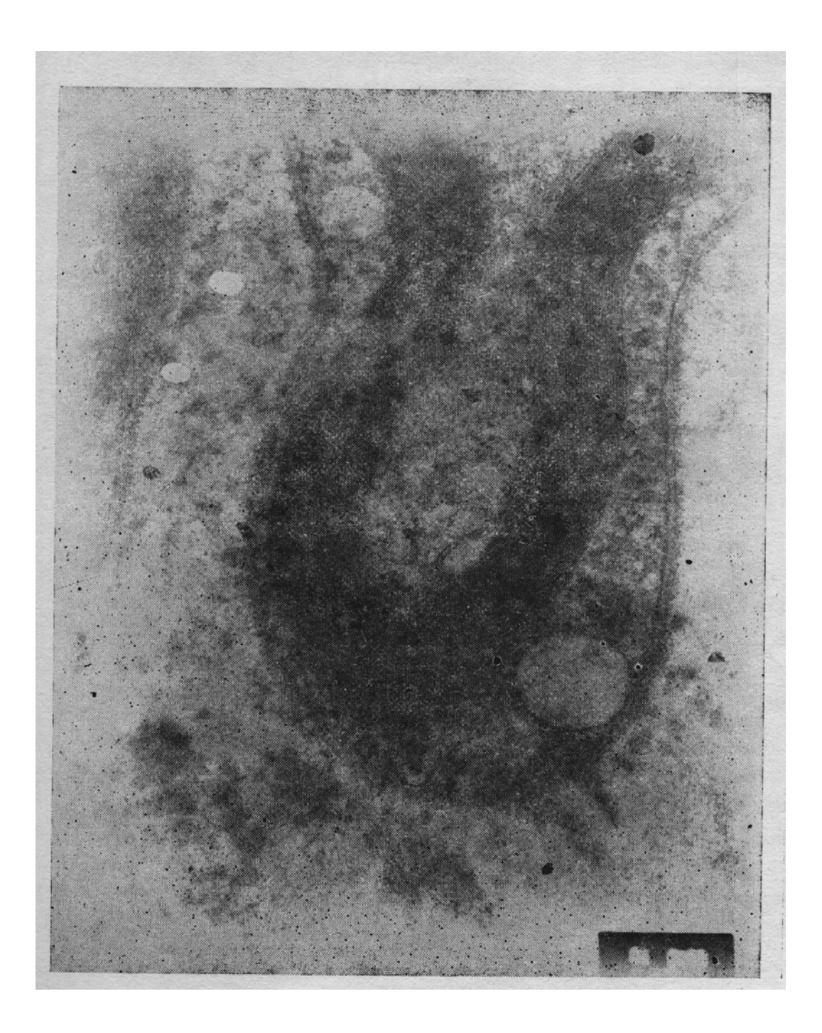
Fig 2. Schwann celicytoplasm-swollen with accumulate material X 11100