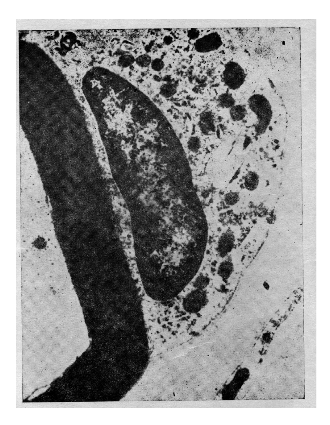
Fig 3. Schwann cell cytoplasm with lipid%11200

In chronic cases Schwann cell hyperplasia in the form of membrane bound slender processes originating from the inner Schwann cell lip and forming honeycomb profiles could be seen in addition (Fig 4). Various irregularities of myelin in the form of retraction, wrinkling, splitting and disruption could also be seen.