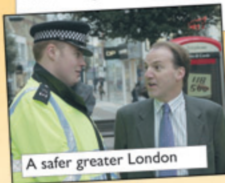
A safer greater London