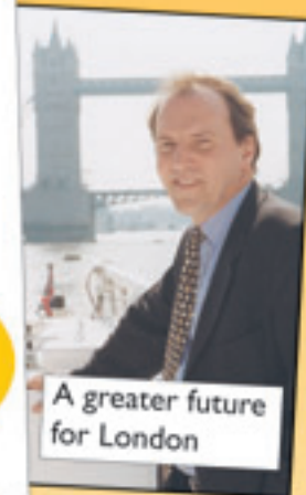
A greater future for London