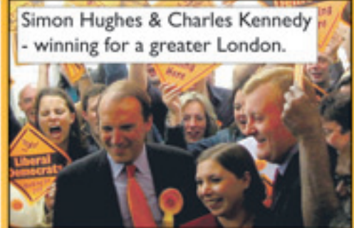
Simon Hughes & Charles Kennedy - winning for a greater London.

This year Lib Dems have won from Labour and Conservatives. We are the serious challengers to the tarnished Labour government.