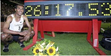
Kenenisa Bekele ETH

Originally announced on 17 November 2005 on www.iaaf.org