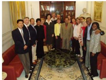
PHOTO: Coaches' Commission and Women's Committee Members together.