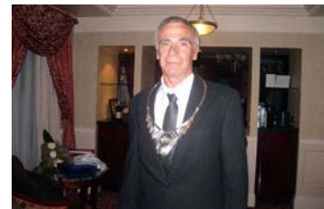
Photo: Saneyev with Silver Order of Merit

The Georgian athlete of the century, Viktor Danilovich Saneyev began his Olympic career in 1968, skipping to two World records in the process of winning his first Olympic title in Mexico City. After twice successfully defending his Olympic crown in the 1970's, in Moscow in 1980, aged 34, he came desperately close to a fourth gold when finishing second with 17.24m, just 11cm away from matching Al Oerter's gold medal record achievement of four Olympic titles in one event.