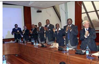
Kenyan delegates applaud decision to award Mombasa 2007 World XC

2008 IAAF World Indoor Championships Valencia, Spain, 7-9 March 2008.