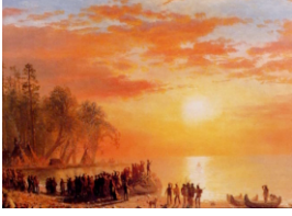
From www.mainememory.net , item #15899, courtesy of the National Park Service, Longfellow Historic Site

The famous artist, Albert Bierstadt, painted this little scene of Hiawatha's Departure for Papa's honorary dinner in London.