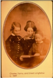
www.mainememory.net , item #15918, courtesy of the National Park Service, Longfellow Historic Site

Spanish! Papa mastered twelve languages. Can you speak a foreign language?