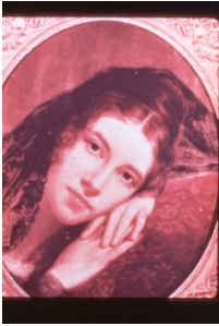
From www.mainememory.net , item #15479, courtesy of the National Park Service, Longfellow Historic Site

– a bronze crane incense burner...temple jars...a diplomatic sword! Well, what can Papa say? He collects “ splendid old things ” too.