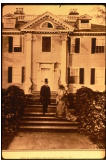
www.mainememory.net , item #15912, courtesy of the National Park Service, Longfellow Historic Site