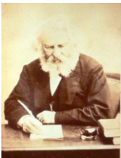
www.mainememory.net , item #15955, courtesy of the National Park Service, Longfellow Historic Site

Ideas also come from the daily news. "The Wreck of the Hesperus" was sparked by a disastrous shipwreck near Boston. Slavery, a divisive national issue leading to the Civil War, inspired seven poems. Papa was a strong anti-slavery advocate along with his close friend, Charles Sumner.