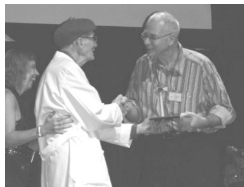
Dr Karl receiving his Ig Nobel Prize from the 1976 Chemistry Nobel Laureate William Lipscomb