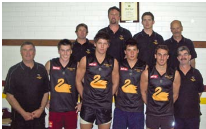
Subiaco's State contingent