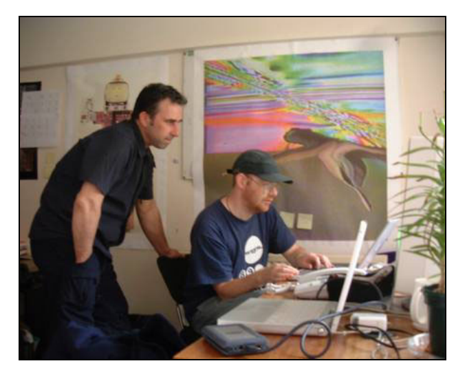
Figure 1. Technologist (right) constructing and participating in the artist's (left) creative environment.