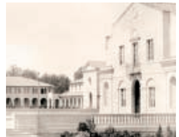
Thomas D. Boyd Hall