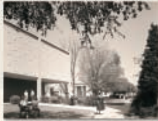
The Middleton Library