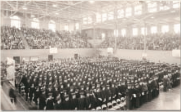
Graduation in Armory