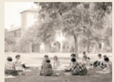
Art Students in the Quad

Pacific West Cancer Fund Pan-American Life Insurance Company Parish National Bank Pfizer Foundation Piccadilly Cafeterias Poindexter Foundation, Inc. PPC Mechanical Seals PPG Industries Foundation Procter & Gamble Company Robinson Brothers Roche Vitamins, Inc. Rockefeller Foundation Rohm & Haas Co. RPM Engineering Rubicon Chemicals, Inc. San Diego Chapter, LSU Alumni Association Sarah Scaife Foundation Satake Corporation SCAVMA Pet Fare Scott Foundation, Inc. Scripps Howard Foundation Seiko Instruments Semiconductor Research Corporation Slidell Towing, Inc. South East Marketing Sterling Chemicals Texas Tiger Tournament The Times/Shreveport Tigers In the Sky, LLC Tyan Computer Company Union National Life Insurance Company Union Planters Bank of LA Uniroyal Chemical Company, Inc. United Technologies Corporation Watson W. Wise Foundation Whitney National Bank William Randolph Hearst Foundation Windway Foundation, Inc. Zen-Noh Grain Corporation