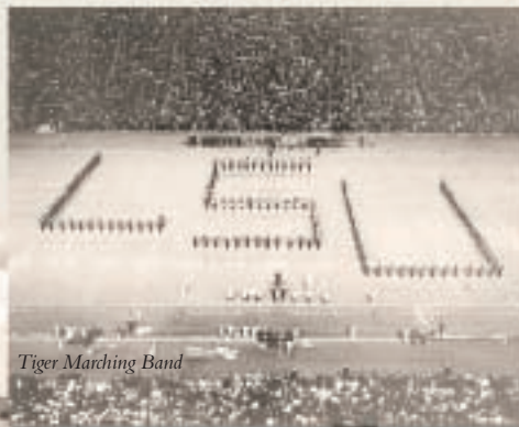
Tiger Marching Band