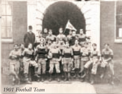
1901 Football Team