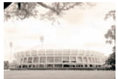
The Pete Maravich Assembly Center