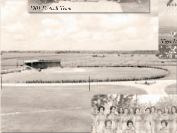
The Baseball Field