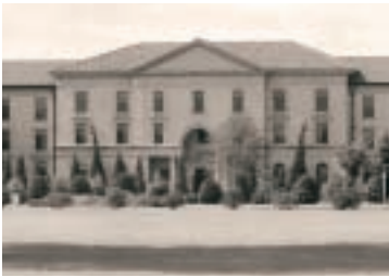
Ruffin G. Pleasant Hall

The 1860 Society is comprised of individuals who have made documented gifts to LSU from their retirement and estate plans. These gifts are in the form of wills, trusts, life insurance policies, retirement plans, annuities and more.