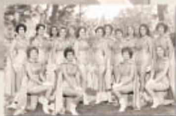
The Golden Girls