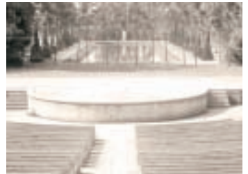
The Greek Theater