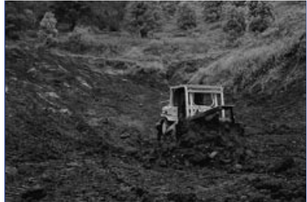
Construction of the Canoeing, Swimming and Fishing hole (Project completed)