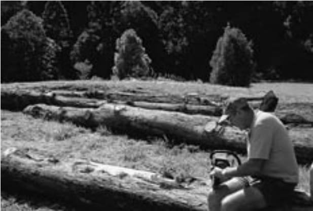
Timber logs were milled on site to provide timber used during renovations