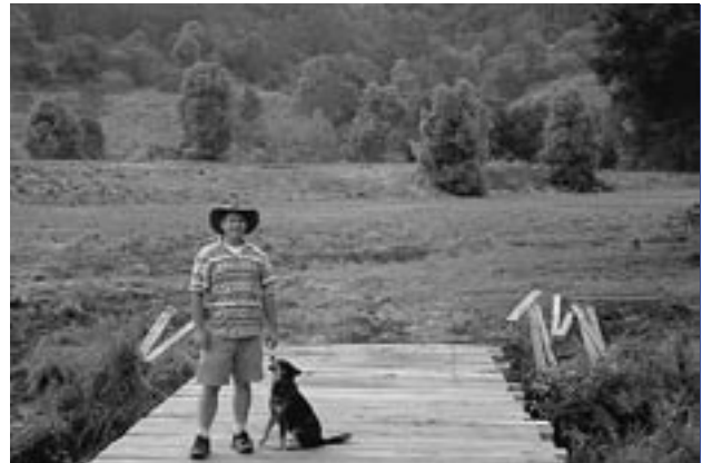
Construction of our first (of four) Log Bridges across Hidden Creek (Project completed)