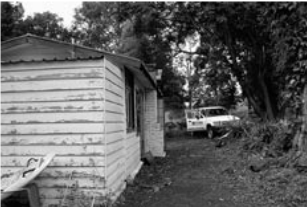
The old Management Quarters being prepared for renovation (Project completed)