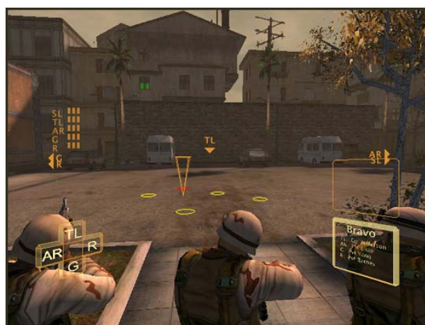
Figure 2: Action Cursor shown on street

The solution to the challenge of creating meaningful interaction with the simulation's entities came in part from what was dubbed the "Action Cursor". Moving the left joystick in FSW instantiates a cursor which anticipates movement orders from a Squad Leader to a Fire Team. These choices include an Object Formation, Corner Formation, Door Formation, Breach Door/Building, etc., and are derived from the physical context of the cursor orientation (see Figure 2).