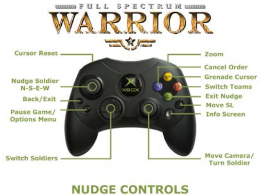
Figure 5: Nudge interface command set

Nudge commands are limited: it was deemed unrealistic to give players the ability to move Soldiers around like chess pieces. A nudge can move a Soldier a few inches, change his individual cover sector or rotate him. The nudge interface command set is shown in Figure 5.