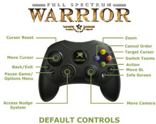
Figure 3: FSW default controls

holding the “A” button during a movement order. The full interface command set is shown in Figure 3.