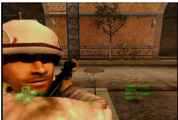
Figure 4: Nudge view of Team Leader

Once a Fire Team member has been selected for a nudge, the camera switches to a close-up view (see Figure 4).