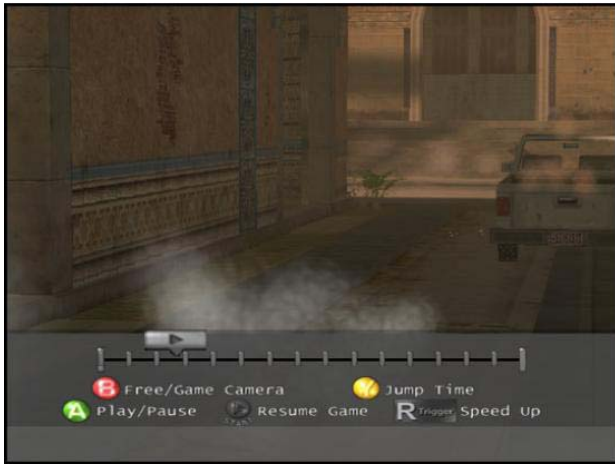
Figure 7: AAR Playback Controls

For After Action Review (AAR), the entire session is captured on the Xbox hard drive and may be replayed in real or variable time with VCR-like controller functionality (see Figure 7).