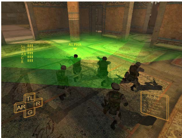
Figure 8: Entity vision cones revealed during AAR playback

In AAR mode, the camera is freely movable around the simulation terrain map. Finally, FSW includes an implementation of Explainable Artificial Intelligence (XAI) developed at the ICT by Dr. Michael Van Lent. This capability reveals entity “vision cones” (see Figure 8) and threat lines (see Figure 9) during AAR playback.