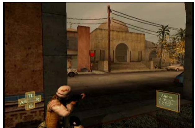
Figure 6: Red icon revealing OPFOR

One interesting challenge arose from the resolution limitations of standard definition television display: optimally, 640 X 480. In the subtended field of view depicted on the main application screen, OPFOR would normally be visible in the mid far range depicted in the simulation. The solution was an iconic widget that floats over the distant OPFOR (see Figure 6) highlighting a character who might not otherwise be seen in this lower-resolution display.