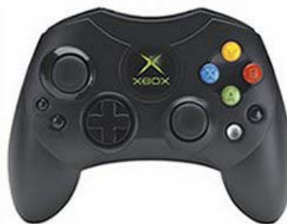
Figure 1: Xbox Controller S

A standard Xbox controller has two thumb-controlled joysticks, a directional key, two proportional trigger keys (mounted below) and eight pushbuttons: two left and six right. There is no keyboard and consequently no convenient way to enter text. There is no mouse, so pointing and clicking, while possible, is more awkward than with desktop and laptop systems (see Figure 1):