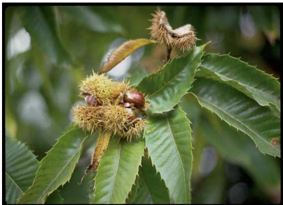
Chestnut burrs beginning to dehisce

In the Central Valley of California, the burrs of the Colossal cultivar will begin to dehisce in mid-September, shedding the nuts. On the North Coast of California, harvest does not begin until early October. Nuts will continue to drop for the next 3 – 5 weeks with or without the burr.