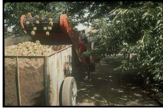
Pick-up machine conveyor belt loading nuts into a bin

The splitting and opening of the burrs is a sign that the nuts inside are mature (mid-September to mid October). Chestnuts add much of their final weight during the last two weeks on the tree. If mechanical shakers are to be used, it should be done as late as possible in order to maximize yield and nut quality. Mechanical harvest (shaking) may need to be done more than once and should not be done before natural nut fall begins. No mechanical system of chestnut harvest has been completely perfected to lower labor costs, however, some existing harvesting techniques for other crops, such as walnuts or filberts may be adaptable to chestnuts. It is easy enough to pick up the nuts and burrs with conventional almond, walnut, filbert, or pecan sweepers, but the main problem is separating the nuts from the burr.