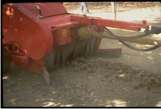
Pick-up machine picking up nuts in burrs from windrow