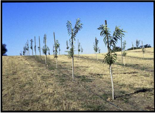
New chestnut orchard - closely spaced