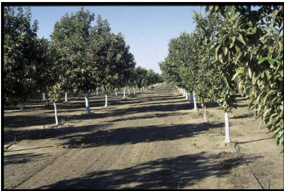
Eight year old orchard - trees are just beginning to touch - very closely spaced

Chestnut trees need to be trained during their formative years to develop a desirable structure e.g. a modified central leader system used for walnuts (See Division of Ag & Natural Resources Publication # 3373 Walnut Production Manual ). Cut back the top of the tree to approximately 36 to 48 inches to compensate for roots lost during digging in the nursery. A single new leader is typically trained up a stake the first growing season. If the grower anticipates mechanical harvest with shakers, the trunk should be, at least, 42 inches high to the first scaffold branch. Branches originating below that can be removed during dormant pruning at the end of the first growing season. The scaffold branches are selected during the second through the sixth growing seasons with good spacing between branches on the main trunk.