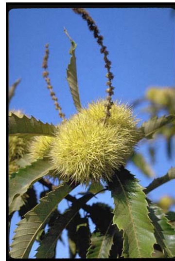
Close up of chestnut burr

Blossoming from mid-June to mid-July, the flowers evade spring frosts so that most cultivars will bear annually. Catkins of some commercial cultivars, e.g. Colossal, produce only a few or no staminate flowers, and other cultivars with staminate flowers may shed their pollen before the pistillate flowers are receptive, therefore requiring cross-pollination. Bees and other insects are attracted to chestnut pollen, which has a distinct odor, but they do not seem to visit the pistillate flowers, presumably because the flowers lack nectar. Therefore, for the most part, chestnuts are wind pollinated. Some research has demonstrated that the pollen parent can have an influence on the pollinated nut, especially with respect to size; a phenomenon called metaxenia. That is, pollen from a tree with large nuts could impart better size to its recipient than pollen from a tree with small nut size.