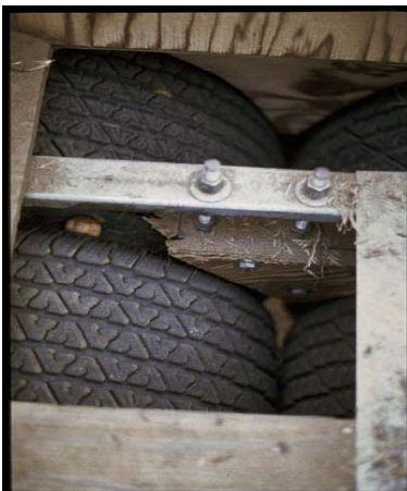
Left: Chestnut wringer made from tires, used to remove nuts from burrs.

Roller drums have been used that are similar to walnut hullers but separation is not complete and many of the nuts are scratched. One California grower has developed a wringer type separator made from tires. It squeezes and twists the burrs to pop out the nuts without scratching the shell. In Italy, some growers use a large vacuum that is pulled through steep terrain to gather the nuts. The nuts are sucked into a rotating drum that separates the burrs from the nuts.