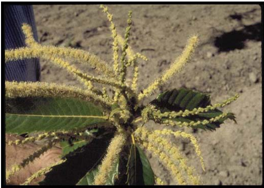
Male and female flowers

Chestnuts are monoecious, bearing both staminate (male) and pistillate (female) flowers on the same tree. They have mixed buds, which break dormancy relatively late in the spring. As the shoots elongate from one-year wood, staminate catkins emerge from lower nodes and a few bisexual catkins grow from near the shoot tip. These bisexual catkins will have one or two pistillate flowers at their bases, the remaining flowers being staminate. Each pistillate flower differentiates into three pistils within the burr or involucre. If pollinated, the ovaries of all three will develop into nuts; the middle one will be flattened. In some cultivars, two pistillate flowers fuse resulting in 4-6 small and poorly shaped nuts.