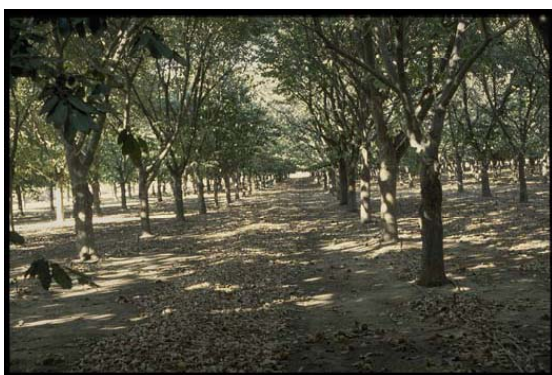
12 year old orchard with crowded trees and excess shading on lower branches

Without topping or shaping, chestnut trees will eventually grow to a height of 35-40'; some timber-form trees will reach 100 ft. The large timber-form trees are not desirable because they are more difficult to manage and much of the tree's energy goes into wood production rather than nut production. A management strategy calling for little pruning or tree thinning should plan on a minimum of 30' to 40' spacing on all sides (27-48 trees/acre). Denser chestnut plantings with tree spacings of between 14' to 25' have been popular (about 70-200 trees/acre) because they will provide greater return per acre in the early years, but they require tree thinning as the canopy's begin to touch. The hedgerow system of trees, closer within the row than between rows, is more efficient for floor management and irrigation layout.