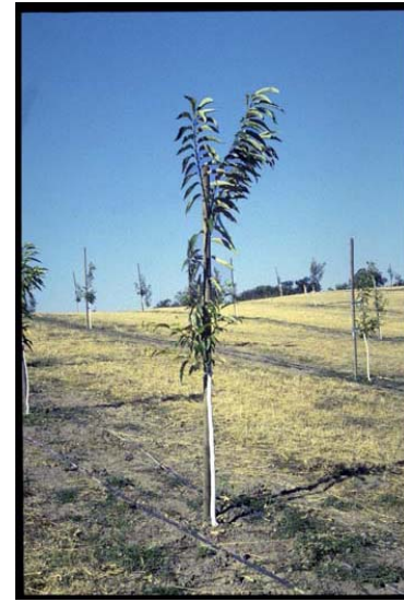
First growing season - trained to a single leader with no branching below 42 inches

Chestnut trees need to be trained during their formative years to develop a desirable structure e.g. a modified central leader system used for walnuts (See Division of Ag & Natural Resources Publication # 3373 Walnut Production Manual ). Cut back the top of the tree to approximately 36 to 48 inches to compensate for roots lost during digging in the nursery. A single new leader is typically trained up a stake the first growing season. If the grower anticipates mechanical harvest with shakers, the trunk should be, at least, 42 inches high to the first scaffold branch. Branches originating below that can be removed during dormant pruning at the end of the first growing season. The scaffold branches are selected during the second through the sixth growing seasons with good spacing between branches on the main trunk.