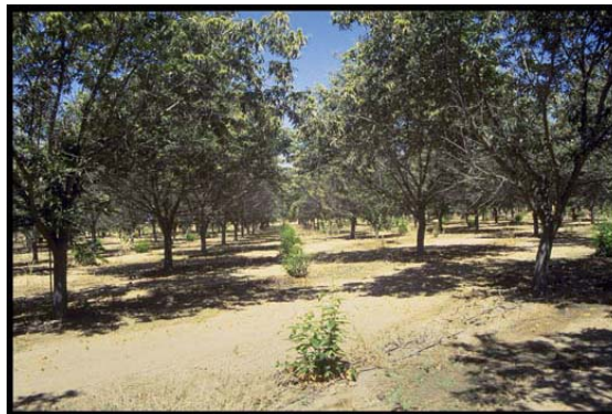
15 year old orchard with every other row removed

Pollenizer trees should be planted at a ratio of one tree for every eight to ten trees of the principle cultivar. If the nut of the pollenizer cultivar is different in size, color, or maturity date than the main cultivar, they should be planted in separate rows to facilitate harvest and separation. Small orchards should have the pollenizer trees planted up-wind from the main cultivar.