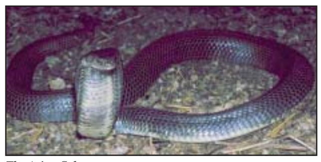
The Asian Cobra.

The Asian Cobra, also known as the Oxus Cobra or Russian Cobra, is the more common of two species of cobras that may be found in Afghanistan. It has smooth skin of olive or brown color, reaches lengths of up to five feet, and possesses the trademark cobra "hood," which it will flare when angry or disturbed. Unlike the Indian Cobra, which has a distinctive spectacle pattern on the back of its hood, the Asian cobra's hood is bare and lacks any recognizable dorsal markings. While the Indian Cobra has been reported to occasionally occur in southern Afghanistan along the border with Pakistan, Asian Cobras are more prevalent in the Northeast. Cobras in general may be distinguished from vipers, another group of venomous snakes in Afghanistan, by the elongated shape of their head which is about the same width as their body. Vipers, in contrast, have triangular heads with a narrow neck and are characterized by shorter, thick bodies. Cobras are attracted to areas abundant in rodents, but will also hunt for frogs, birds, and even other snakes in the early evening and morning hours. These snakes do not spit venom like their counterparts in Africa, but they can be very aggressive if provoked and deliver deadly venom in their bite, so extreme caution should be exercised if they are encountered.