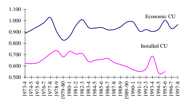
Figure 1 Economic and Installed Capacity Utilization in Indian Manufacturing

The estimated parameters and the time series data are employed with (8) to calculate the potential output (Y*), the output where the short run average total cost is minimized, which is used to estimate economic CU. As a closed form solution is not possible for (8) a numerical iterative technique is followed. The ensuing estimates of CU ratios,