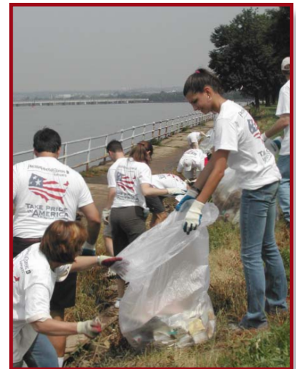
Charter Partner PricewaterhouseCoopers sponsored an employee work day to clean up Hains Point in Washington, DC.

Take Pride appreciates all of the resources that the partners give. We showcase partner contributions on our website, in the newsletter and on special materials like the Volunteer Guide or programs for sponsored events.