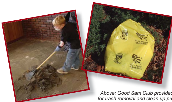
Above: Good Sam Club provided bags for trash removal and clean up projects.