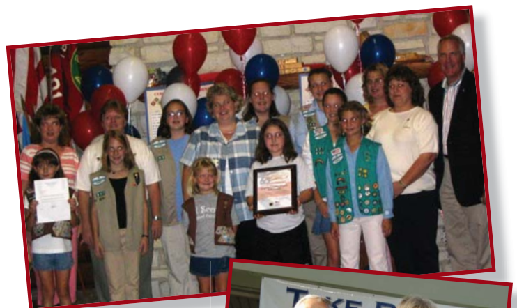
Above: Congressman John Shimkus presents the Congressional Take Pride Appreciation Award to the Fayette County Girl Scouts for their work at Camp Marill in Vandalia, Illinois.

The Take Pride in America City program promotes volunteerism at the local level. Mayors of a Take Pride City pledge to host at least two Take Pride events each year, and encourage the expansion or creation of volunteer opportunities in the community for promoting stewardship of public lands. They also participate in the annual National Take Pride in America Awards by nominating outstanding local projects and volunteers.