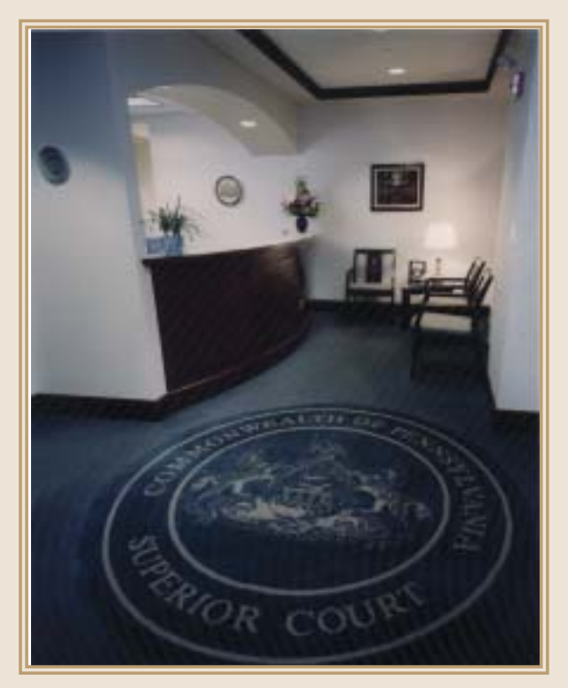
Office of the Prothonotary, Pittsburgh