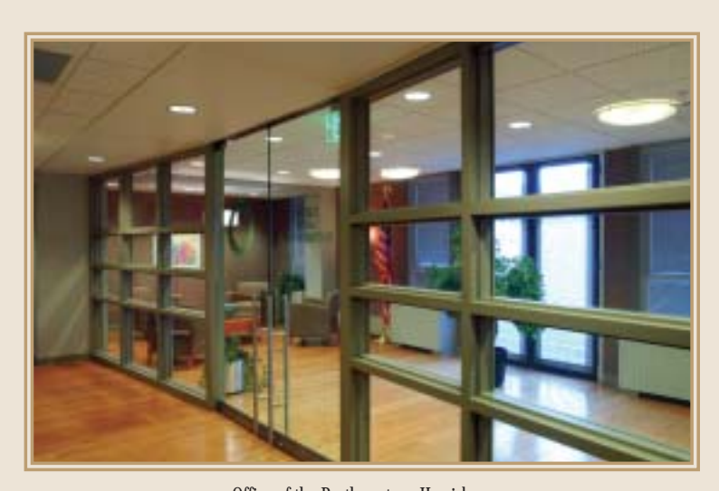
Office of the Prothonotary, Harrisburg