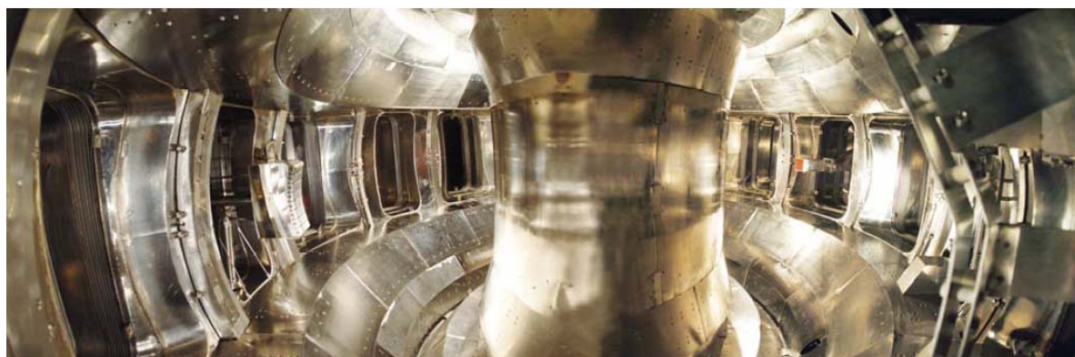
Fig. 1 Picture of the in-vessel structures

After the first very successful engineering commissioning in March 2006, EAST (Experimental Advanced Superconducting Tokamak) has achieved, in day one of operation, the first plasma with plasma current up to 220 kA, in collaboration with General Atomic (GA) and Princeton Plasma Physics Laboratory (PPPL), USA. This has demonstrated that EAST construction is completely successful. EAST is the first full superconducting tokamak at mega-ampere scale presently in operation. It will be a unique facility to explore some critical issues relating to steady-state operation with shaped plasma cross-section in the next few years.