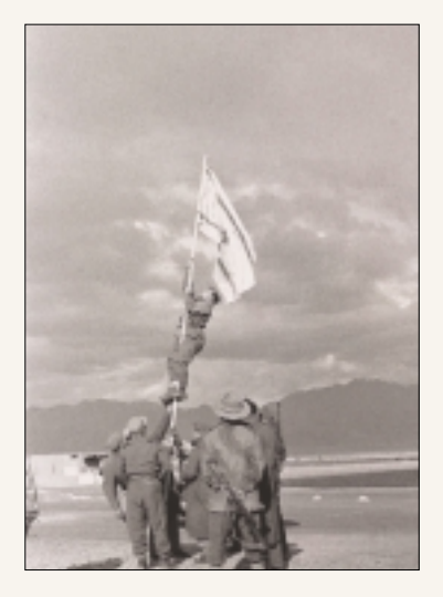
The "Ink Flag" at Eilat, March 10 1949.