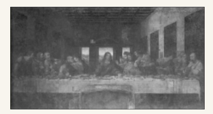
Leonardo da Vinci, The Last Supper , 1498, fresco in the convent of Santa Maria delle Grazie. Milon, 15 x 29 feet

Prime Minister Yitzhak Rabin by a right-wing Israeli, a traumatic event that disrupted a promising peace process and revealed vast rifts in Israeli society, intensified the nation's soulsearching. Nes' Soldiers Series simultaneously illuminates the spectrum of masculine identity and investigates the mythology of one of the bedrock institutions of Israel.