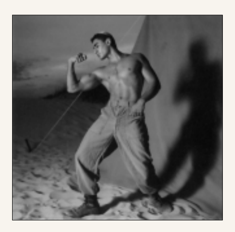
Untitled, 1996, 90 x 90 cm.

no longer a hardscrabble land of idealistic Zionists; it was a booming, cosmopolitan nation with all the attendant problems. Increasingly, its citizens asked whether the country was, as its founders believed, a good kid in a bad neighborhood or a bully cruelly repressing the Palestinians. Young artists like Nir Hod and musicians like Aviv Geffen openly expressed undercurrents of dissent. They questioned mandatory military service as well as conventional gender roles—something shocking in a place where adolescent existential angst traditionally took a back seat to patriotic duty. The 1995 assassination of