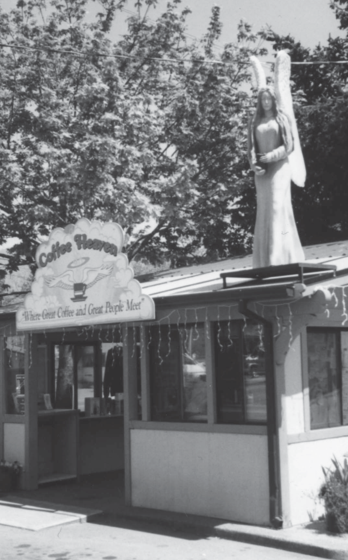
Angel on Cave Junction's Coffee Heaven is now a well-known image in town.