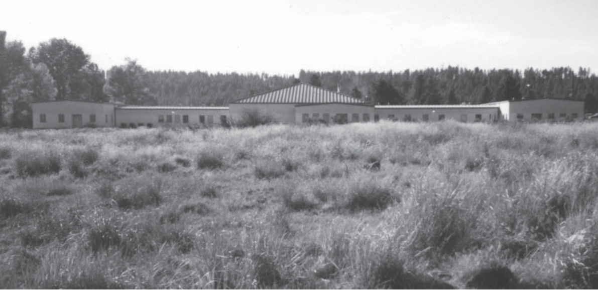
Klamath Tribes site (before park development) adjacent to the new Tribal Administration Building.

was adept at drawing out ideas from local people and incorporating them into the plan they created for consideration by the Klamath Tribes, and that he was very thankful for that.