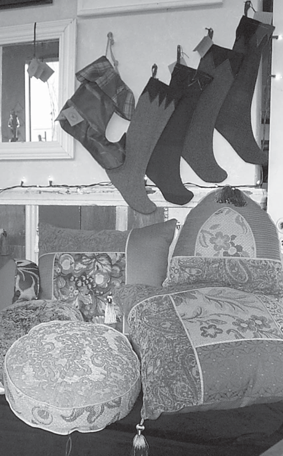
Products created with recycled fabrics and materials at the Trillium Gallery.