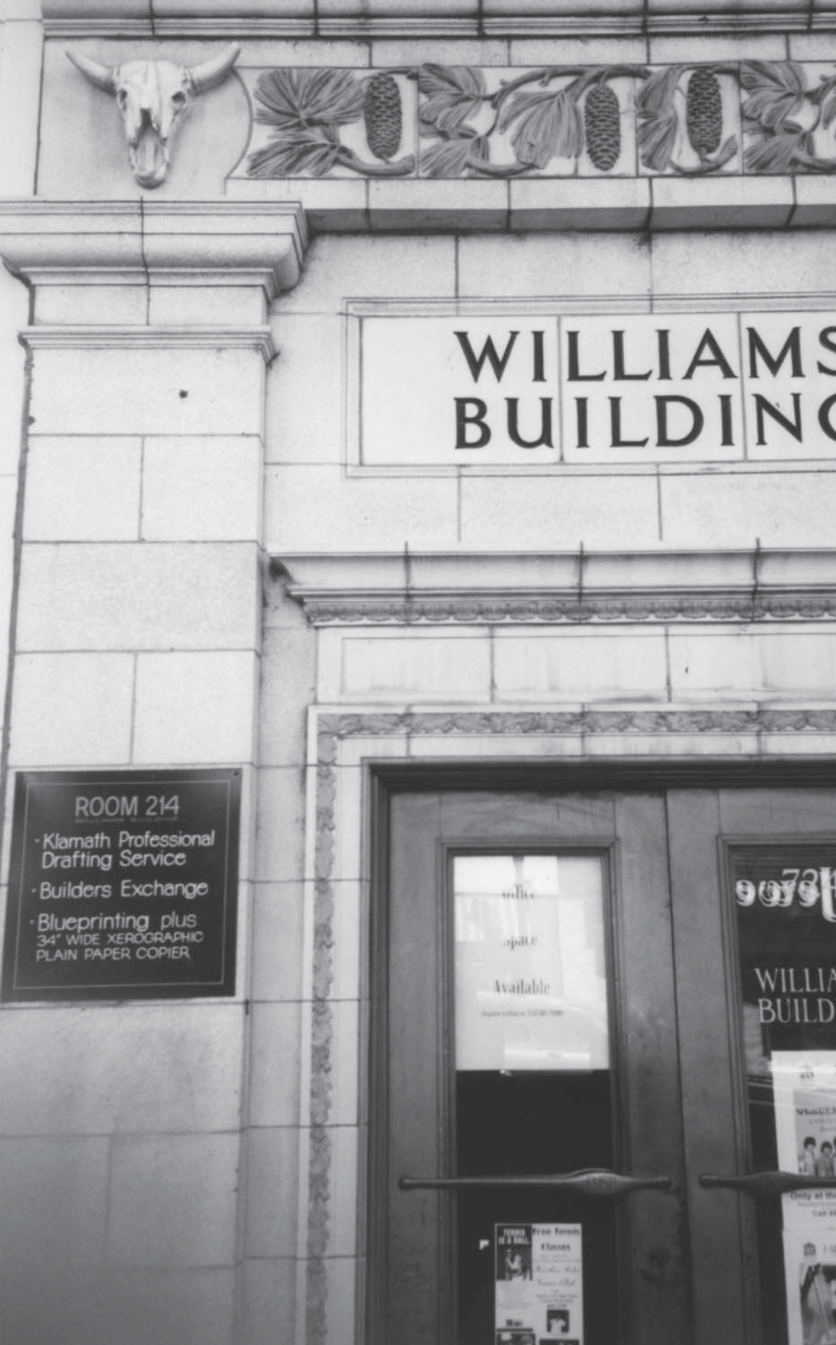
Locally inspired terra cotta ornament on a downtown building contributed to the development of downtown Klamath Falls' public art plan.