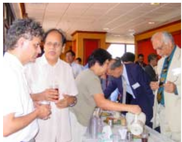
Participants interacting between sessions

We invited to Hong Kong 35 representatives from research institutes in China and India, as well as a smaller number from Japan, Korea, Taiwan and Hong Kong, to come together in a small conclave at the University of Hong Kong. The papers ranged from those which examined global issues, to more specific regional issues, to questions