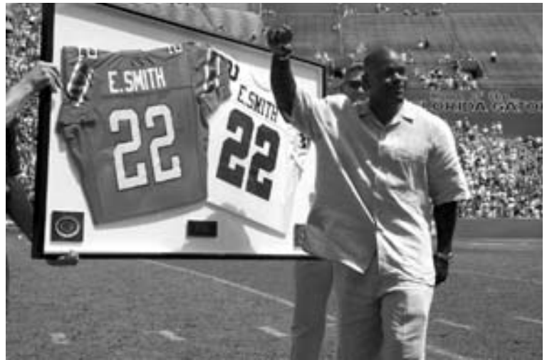
On April 12, 2003, Florida fans got the opportunity to recognize one of their own as Emmitt Smith was honored at halftime of the 2003 Orange and Blue Spring game.

Smith was a three-time All-American at the University of Florida from 1987-89. He established 58 school records in three seasons, including a career rushing mark of 3,928 yards. Following his junior season with the Gators, Smith was a first-round selection in the 1990 NFL Draft by the Dallas Cowboys. On Friday, Feb. 4, 2005, Smith retired from the NFL. Smith starred for 13 seasons with the Dallas Cowboys and spent the last two years with the Arizona Cardinals. He finished his career with 18,355 rushing yards and 164 rushing touchdowns, both of which are the highest totals ever posted in NFL history.