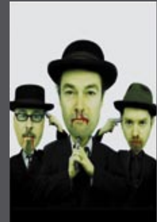
The Tiger Lillies

Regarding drama, one of the theatre productions will be The Little Match Girl , a darkly humorous and wild play by the Tiger Lillies, inspired by Hans Christian Andersen's tale.