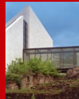
I.M. PEI, architect design

As of its opening, Mudam will gradually reveal its collection of contemporary art. Mudam will also present thematic and monographic exhibitions open to all the fields of contemporary creation: photography, painting, video, new media, fashion, design, graphics, sound and architecture.