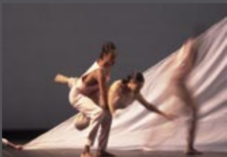
Trisha Brown Dance Company