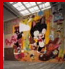
Michel Majerus, Katze, 1993 Installationsansicht Kunsthalle Basel, 1996

The collected works (paintings and installations) of Michel Majerus will be assembled for a first great monographic exhibition at the Musée d'Art Moderne Grand-Duc Jean. The vernissage is part of the official opening programme of "Luxembourg and Greater Region, European Capital of Culture 2007".