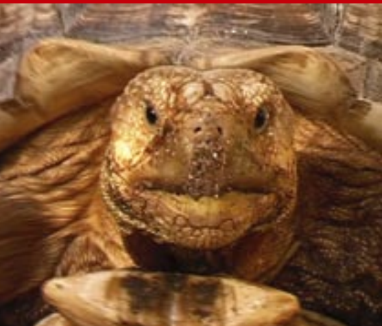
Su-Mei Tse, "Die ICH-Manifestation", Installation, 2005

Solo exhibition of the Luxembourg artist Su-Mei Tse, winner of the Golden Lion for the best national participation at the Venice Biennial in 2003. In her videos and installations, the artist associates sound, rhythm and music with poetic images and objects thus giving way to surprising choreographies.