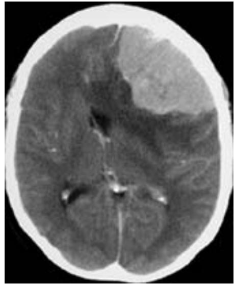
Fig. 1. Contrast-enhanced axial CT scan obtained in a 59-year-old woman, revealing a well-circumscribed homogeneously enhancing meningioma based along the left frontal dural convexity. The lesion produces mass effect with midline shift and surrounding edema.