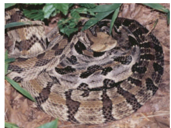
During courtship males will "chin tap" the dorsal surface of females.

Timber Rattlesnakes, like all rattlesnakes, do not lay eggs but give birth to "live" young. Litter size tends to vary geographically, but is typically from 5 to 15 young (discussed in Brown 1993). The mating season for Timber Rattlesnakes generally lasts from late July through August, during which time male timbers make extensive moves in search of receptive females. Although mating takes place in late summer, females will not give birth until the fall of the following year. It is likely that they overwinter with the sperm and that the eggs are fertilized in the spring.