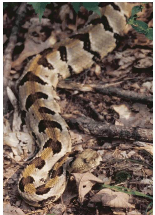
Male Timber Rattlesnakes make lengthy movements during the mating season in search of females.

long migrations in search of females, and will triple their movement rates from earlier months and often expand their range. In contrast, females show little, if any, range expansion or movement increases at this time. Both male and female adult timbers exhibit strong tendencies to use the same areas each year and may overlap movement paths from one year to the next.