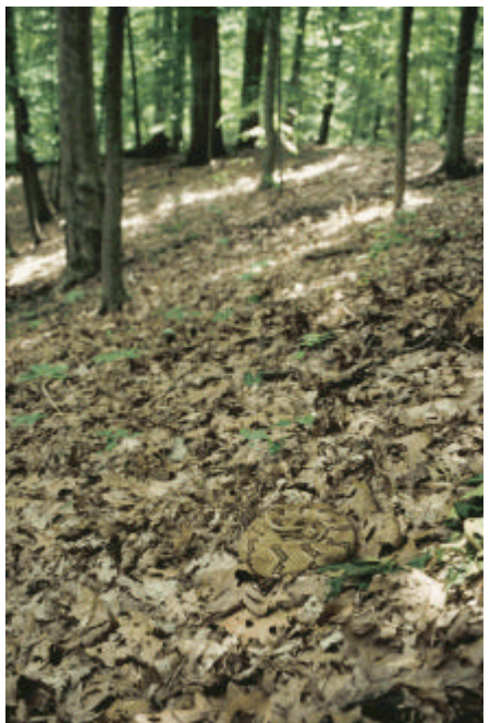
Timber Rattlesnakes inhabit eastern deciduous forests. Note snake in foreground.

Although non-gravid timbers rarely leave the confines of closed-canopy forest, gravid females tend to use open, sparsely forested, sometimes rocky areas for gestating young. In Indiana, gravid females were also found to frequently utilize the inside of large hollow logs within these open areas. Such site selection likely provides the pregnant snakes with optimal environmental conditions, such as warmth, humidity, and a more stable microclimate, for embryo development.