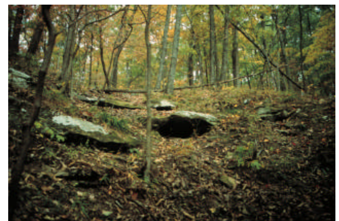
Hibernacula site in Indiana

Timber Rattlesnakes show a high degree of fidelity to the same den site and studies have shown that