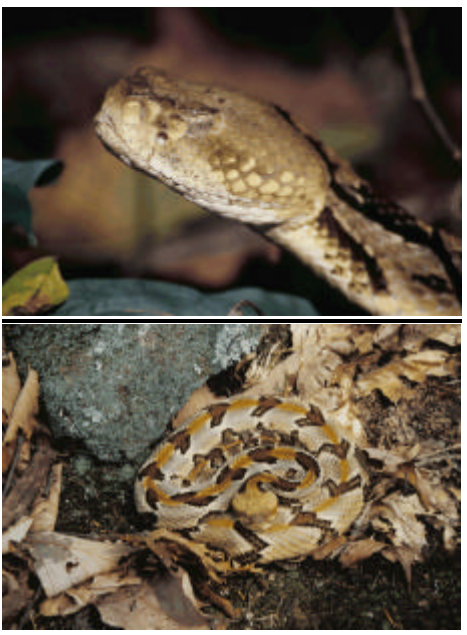
Dark, often chevron-shaped, crossbands are characteristic features of the Timber Rattlesnake.

Timber Rattlesnakes have the characteristic rattlesnake features: a large, angular head, heat-sensing facial pits, and a rattle at the tip of the tail. The color pattern appearance of adults is highly variable, with ground coloration ranging from yellow and brown, to gray or black. All timbers possess dark, often chevron shaped, crossbands along the dorsal surface. In black individuals the crossbands may be less distinct and difficult to see. Ground coloration darkens posteriorly, and all timbers have uniform black or dark brown tails regardless of head or ground coloration. Dark bands behind the eyes can be found in some individuals, as can a rust colored middorsal stripe running from head to tail. Juvenile timbers are patterned with dark crossbands, but are always gray in ground coloration. Color patterns diverge as the snake ages and grows. Adult Timber Rattlesnakes are large stout-bodied snakes that can reach lengths of 50 to 60 inches depending on geographic location.