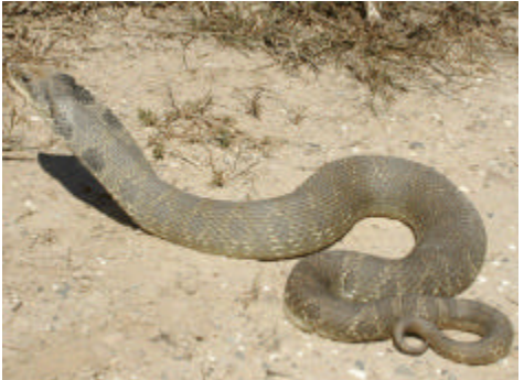
Eastern Hog-nosed Snakes may also have similar coloration to timbers, however they lack the characteristic rattle.

Several other heavy bodied snakes such as the Copperhead ( Agkistrodon contortrix ) and the Eastern Hognosed Snake ( Heterodon platirhinos ) can occupy the same habitat as Timber Rattlesnakes and may look superficially like timbers. Additionally, some snakes such as Milksnakes ( Lampropeltis triangulum ) and certain watersnakes ( Nerodia spp. ) may have similar coloration with blotched or banding patterns. However, all of these snakes lack rattles and have tails that come to relatively sharp points at the tip. Even if a rattlesnake has had its rattles broken off, it will still possess a tail that comes to an abrupt, squared off end.