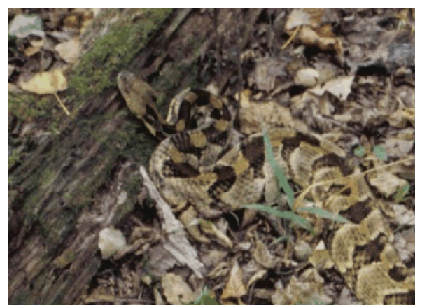
Timbers often forage with their heads resting on the side of a mammal runway, such as this log.

Timber Rattlesnakes feed primarily on small mammals . Clark (2002) found that the diet of Timber Rattlesnakes varies geographically and is highly dependent on what mammalian prey are available. In the Midwest, voles, chipmunks, and even squirrels appear to make up a large part of the timber's diet. Timbers have also been known to consume birds and even other reptiles and amphibians. However, ingestion of these prey items is rare and constitutes only a small fraction of their diet.