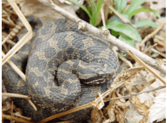
The Eastern Massasauga has a blotched dorsal pattern.

Massasaugas and Pygmy Rattlesnakes belong to the genus Sistrurus , and as such can readily be identified from Timber Rattlesnakes, and all other members of the genus Crotalus , by the presence of nine large, plate-like scales on the top of the head. This is in contrast to numerous tiny scales on the heads of rattlesnakes in the genus Crotalus . In addition, the heads of Massasaugas and Pygmy Rattlesnakes are noticeably more rounded and proportionally smaller than timbers. Overall, massasauga and pygmy rattlesnakes are considerably smaller than timbers. In fact, these rattlesnakes rarely grow to more than two feet in length.