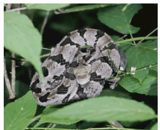
Juvenile Timbers may use trees and shrubs for refuge.