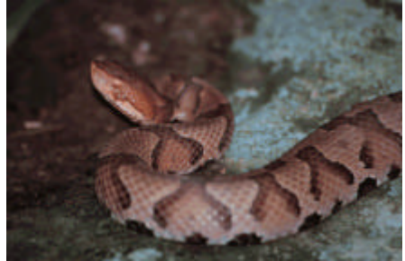
Copperheads have an hourglass pattern along their dorsum. They also lack a caudal rattle.

massasaugas and appear more like bars than spots. Finally, both Pygmy rattlesnakes and Massasaugas possess a white-rimmed, dark stripe that runs through or near the eye and down the face. While similar postorbital bars may be present in Timber Rattlesnakes, they are never rimmed with white.