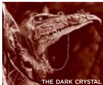
THE DARK CRYSTAL

Co-directed and written by Jim Henson. US, 1982, color, 93 min.