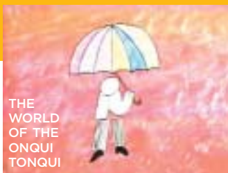
THE WORLD OF THE ONQUI TONQUI

social conscience and middle-class guilt has her taking drastic steps with shoes.