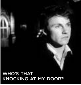
WHO'S THAT KNOCKING AT MY DOOR?