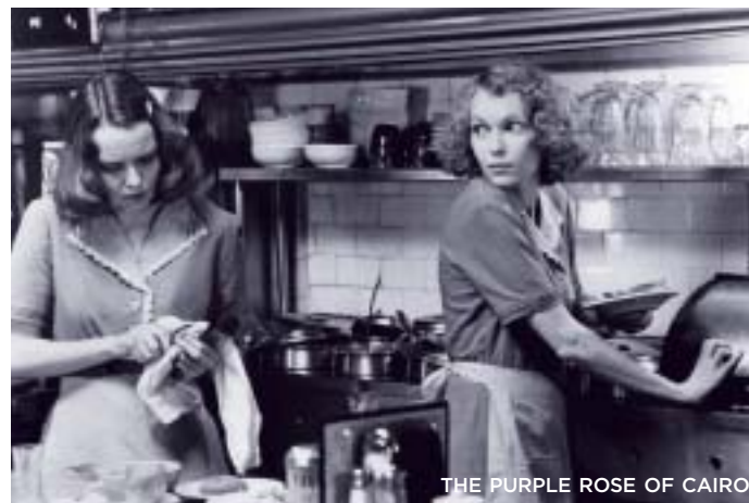
THE PURPLE ROSE OF CAIRO

cop's daughter Trudy Knockenlocker (Betty Hutton) comes back pregnant from a date with a soldier, but it's okay. Complete with a curtain ring on her left hand, she actually married Private... Ratsky-Watsky?! Crusty dad William Demarest enlists her perennially hapless swain Eddie Bracken to the rescue in Preston Sturges' frenetically hilarious small town version of the Immaculate Conception—except this time it's... how many tuplets?