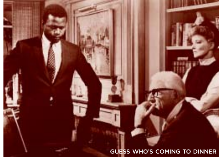
GUESS WHO'S COMING TO DINNER

On June 29, 2003, the world lost its First Lady of Cinema: Katharine Hepburn, or simply, Kate. The greatest actress to grace the screen (she is ranked #1 Woman in the AFI's "50 Greatest Movie Legends"), Katharine Hepburn reigns as the only four-time Oscar recipient for acting. (She is second in nominations only to Meryl Streep, who passed her in 2002 with her 13th nod). Hepburn's career met with requisite ups and downs (including rebounding from the moniker of "box office poison"), as she continued to break new ground and defy convention with strong portrayals of striking women. Hepburn was once quoted as saying, "Wouldn't it be great if people could get to live suddenly as often as they die suddenly?" Fortunately, Hepburn's act of "living suddenly" is captured often in an impressive body of work. AFI is honored to present a representative selection of work from her magnificent seven-decade career, including—from AFI's June 2002 list of 100 Passions, in which Hepburn led all actresses with six films—PHILADELPHIA STORY (#44), BRINGING UP BABY (#51), AFRICAN QUEEN (#14), ON GOLDEN POND (#22), GUESS WHO'S COMING TO DINNER (#58) and WOMAN OF THE YEAR (#74).