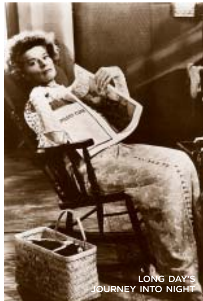
LONG DAY'S JOURNEY INTO NIGHT

Directed by Sidney Lumet. 1962, b&w, 174 min.