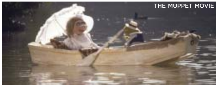
THE MUPPET MOVIE