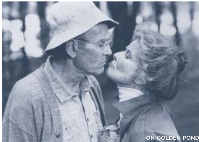
ON GOLDEN POND

Adapted by Ernest Thompson from his own play, ON GOLDEN POND