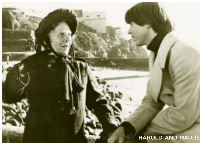
HAROLD AND MAUDE

As AFI honors the passing of Katharine Hepburn with a tribute that includes many of her collaborations with Spencer Tracy, this seems a fitting time to celebrate some other memorable screen pairings, assembled from the complete collection of AFI 100 lists.