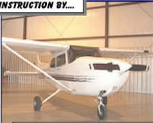
Midwest Flight Academy at 815-762-5676