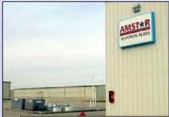
100LL Avgas and Jet A fuel

DTMA's FBO (Fixed Base Operator) is: J.A. Air Center