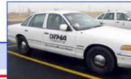
Airport Courtesy Cars