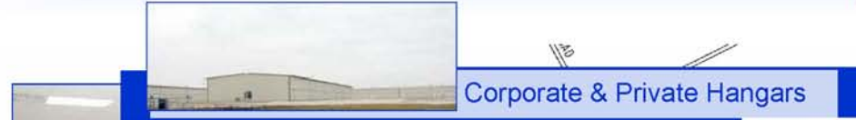
Corporate & Private Hangars