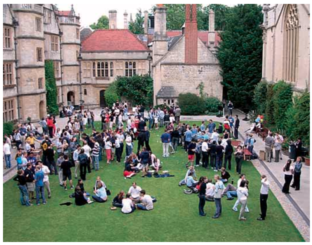
JCR Garden Party