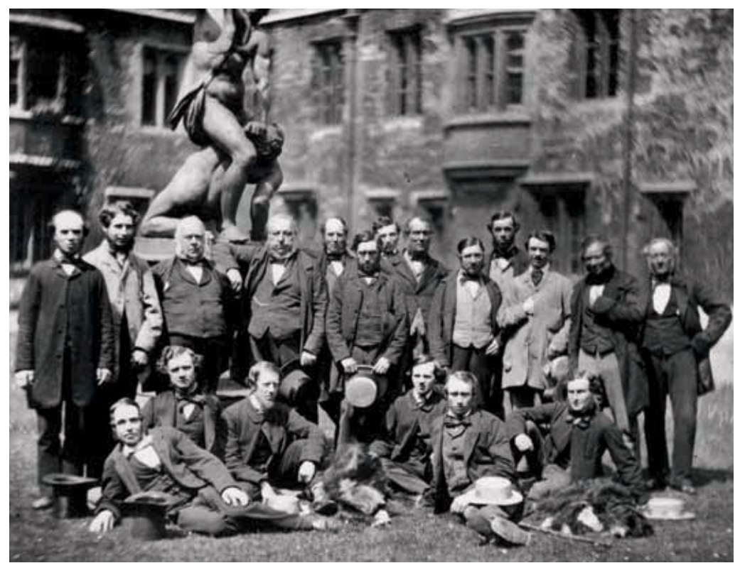
Porters Of Brasenose in 1861