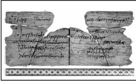
A Roman Tablet