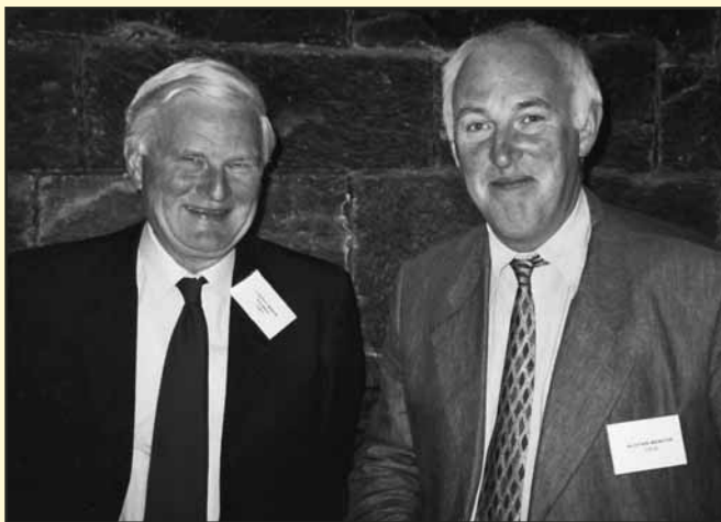
The Northwest Party, 2003