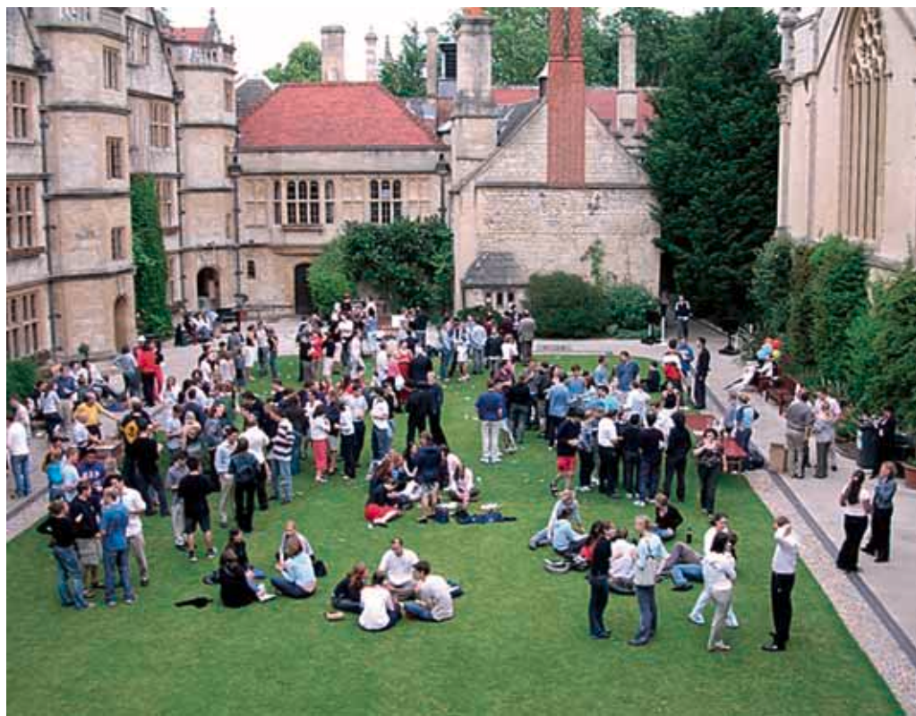
JCR Garden Party