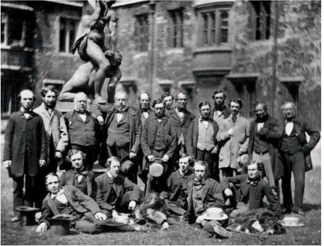
Porters Of Brasenose in 1861