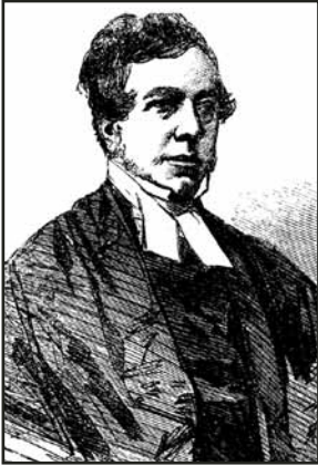
William Webb Ellis, 1806-1872

For a few days last November Brasenose's most celebrated old member was not William Golding, John Buchan, Arthur Evans or John Foxe, but a rather unremarkable nineteenth-century clergyman named William Webb Ellis. Jonny Wilkinson's last-minute drop goal gave Ellis' name, inscribed as it was on the trophy England subsequently collected, a currency far beyond Rugby circles, and certainly far beyond Ellis' own wildest imaginings. It may well be true that a crucial step in the creation of a distinct game of Rugby was Ellis' impulsive