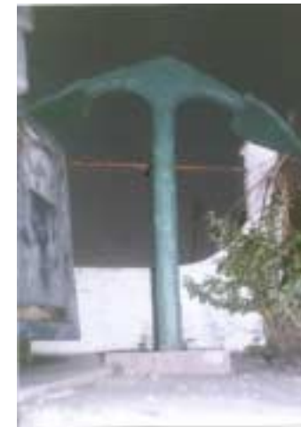
An anchor recovered from a sunken galleon in the treacherous San Miguel Pass off Ticao Island is on display at San Jacinto town plaza.

To date, the Pilipino Telephone Corp. (Piltel) has installed phone lines for over 2,000 households and business establishments in the maintown and has established calling stations in the towns of Milagros and Cataingan. Long distance phone calls can be made through other companies, such as RCPI-Bayantel and PT&T .