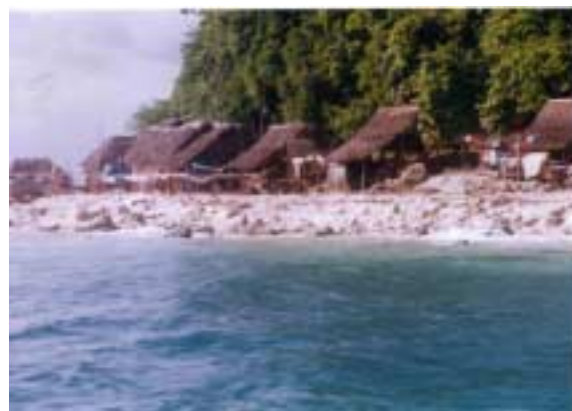
A typical fishing village in the town of Batuan. Fishing is one of the major industries in Masbate.

The municipal ports are served by motorized boats which can accommodate 50 passengers. These same ports connect the municipalities to Bogotown in Cebu, Estancia town in Capiz, Pasacao town in Camarines Sur, and to Pilar and Bulan towns in Sorsogon.