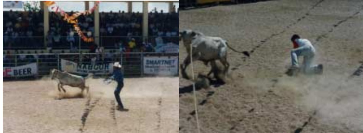
The rodeo Masbateño is a yearly attraction that draws thousands of cattle raisers and cowboys to Masbate. It is a sports of skill and stamina.