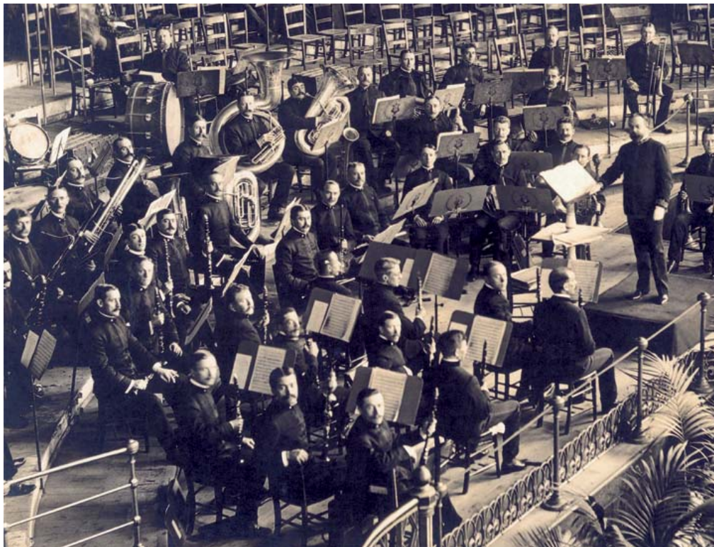
Figure 1: The John Philip Sousa Band: London, 1903

In 1892, after conducting the U. S. Marine Band for twelve years, Sousa organized his own professional band. For the next forty years this ensemble toured throughout the United States, made four trips to Europe, and one thirteen-month tour completely around the world. 20 The Sousa Band was recognized everywhere as one of the premiere ensembles of its kind.