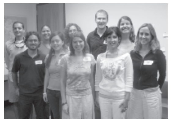
New MALAS students at the Fall 2006 orientation.