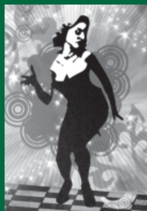
Cincodelic Bistro Exhibit