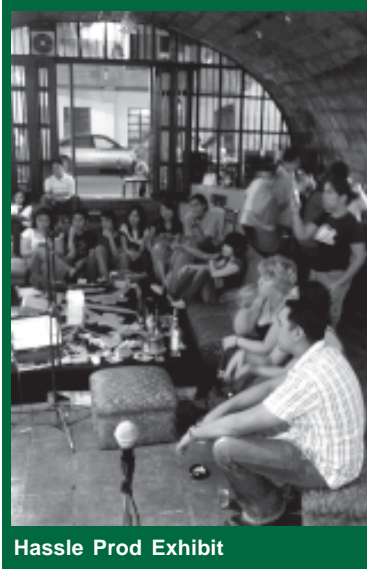
Hassle Prod Exhibit

As the SDA gears up for the debut of their three latest offerings, Nolasco asserted, "We hope that these programs become very successful in two ways: that we churn out quality students and then boost their careers in their chosen industries. Also, we want to develop these programs in such a way that our country becomes a center of creativity in Asia through the SDA."