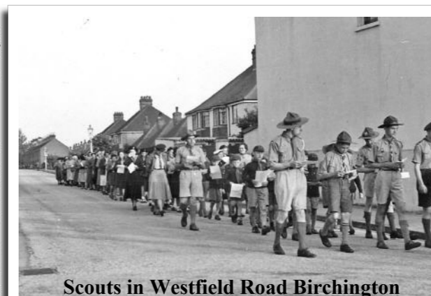
Scouts in Westfield Road Birchington