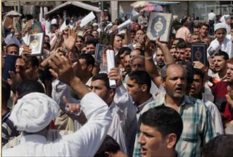
Iraqi citizens protest the suicide car bombings in Baghdad