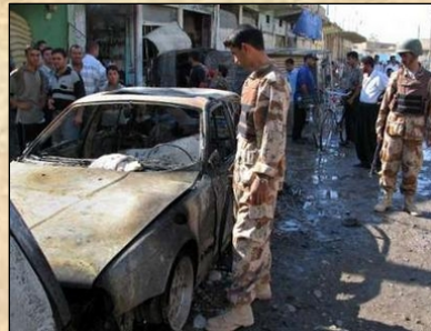
The aftermath of a car bomb targeted at Islamic worshippers exiting a Shi'ite mosque in Tuz Khormato

The Iraqi people, with help from coalition nations, continue to succeed in reconstruction, economic development and fighting terrorism