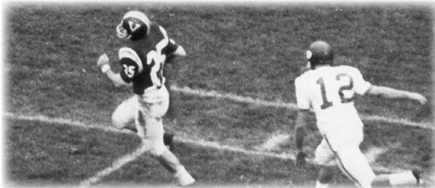
Coach Frank Beamer's lone collegiate touchdown came on an interception return (above) against Richmond in 1968.