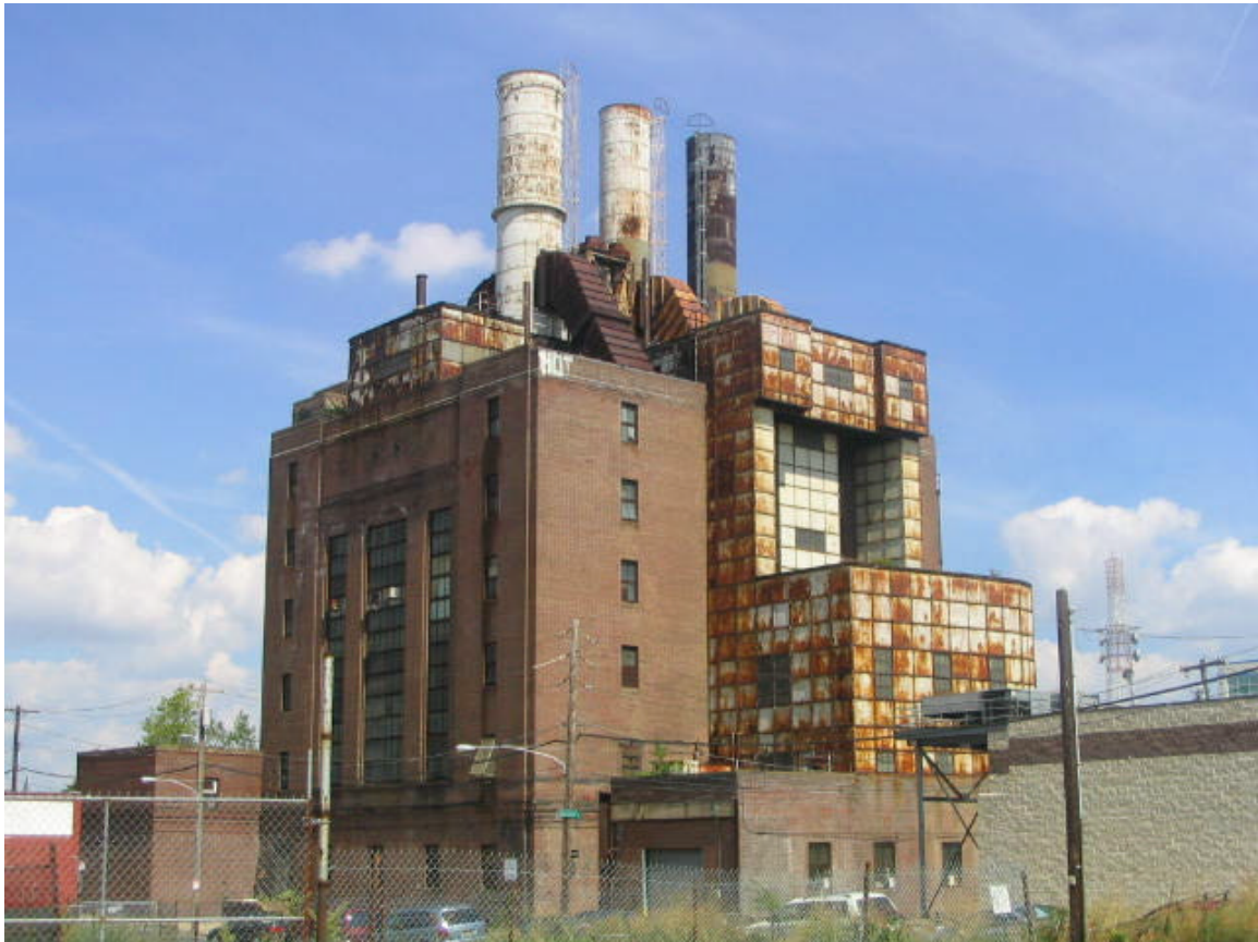
The vacant Trigen Building at 411 N. 9 th Street