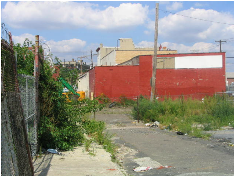
Percy Street looking north

Percy Street (pictured below) does not meet City standards for street width. It is an overly narrow 30 ft. wide stub end street with no space for turnaround. It is a blighting influence on the area. Dead end streets are prohibited for new streets under section 14-2104 (3) of the Philadelphia Code.