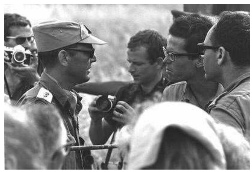
A UNEF liaison officer says goodbye to the Israeli officer in charge of the Erez border checkpoint just prior to the removal of UNEF forces from Kings Gate.

U Thant's decision was still provoking great unease within the UN, as reported by The Times: "Quite a few countries feel that the force should not have been withdrawn and virtually disbanded so suddenly at the behest of the United Arab Republic without allowing the United Nations General Assembly, which authorized its coming into existence, to discuss the matter...efforts (are) being made to see if some alternative basis for securing the Israel-Egyptian border...Most European and American countries and also a fair number of Asian and African countries, would welcome some such "salvage" operation. It would be resisted and rejected by the communist block, which has in the past consistently espoused the Arab case against Israel...Brazil and Canada (members of the Security Council) have contributed contingents to the Emergency Force (and) are believed to have argued against its withdrawal.