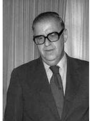
Israel's foreign minister Abba Eban met with UK Prime Minister Harold Wilson at 10 Downing Street. Wilson revealed that the Cabinet had met that morning and concluded that Egypt's blockade "must not be allowed to triumph; Britain would join with others in an effort to open the Straits."

"The British radio and television, which I turned on briefly before retiring, were full of sympathy for Israel, but they had a distinctly funereal air." - Abba Eban noted in his diary, on returning to his hotel, that evening. [10]