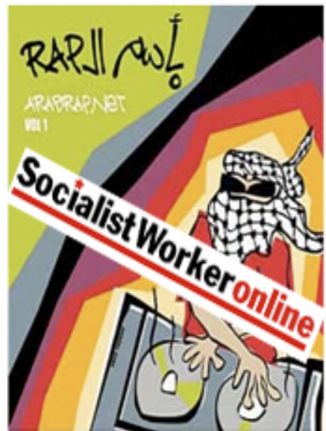
Arab rap album cover

It's a hot night in the centre of the Palestinian West Bank town of Ramallah. Tonight the peace is disturbed not by the Islamic call to prayer or Israeli gunfire but by the sound of hip-hop music.