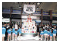
Attention for World Games 2001 at Akita Railway Station

A second meeting of the Akita Organising Committee and the Technical Delegates appointed by the International Federations was held in Tokyo on 21st of January. Most of the TD's attended the meeting while absent officials were represented by administrators from National Federations.