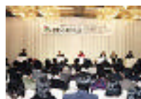
Seminar of the occasion of 999 days to go