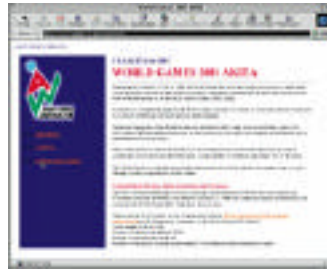
The AOC's website

Committee (AOC) publish a newsletter four times a year. The magazine will be distributed to a variety of organisations within the Akita Prefecture. On the world-wide web a site has been launched, to be reached at: www.wg2001.or.jp