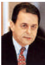
Dr. Jacques Rogge

The next meeting of the Executive Committee of the IWGA was scheduled to be combined with the meeting of the Co-ordination Group, in April in Akita. Due to circumstances this meeting has been cancelled and postponed till Friday, 25 June and will now be held near Brussels (BEL). It will be the first opportunity for the observer of the IOC on the Committee, Dr. Jacques Rogge, to formally meet the Executive Committee Members.