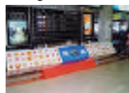
Attention for World Games 2001 at Akita Airport

On 15th and 16th April the Co-ordination Group for the World Games 2001 will meet again. The IWGA will be represented