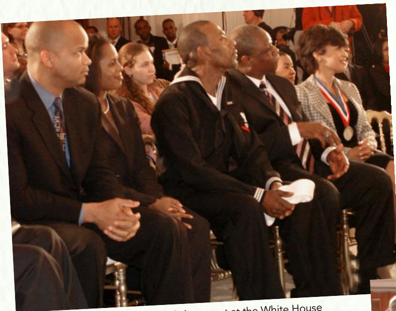
Link Joan E. Higginbotham, NASA Astronaut at the White House