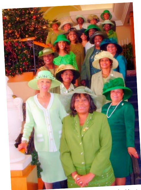
Gorgeous in Green Broward County Links Host Tea Benefiting American Diabetes Association

Members of the North Broward County (FL) Chapter of The Links, Incorporated (NBC Links) gathered at the Boca Country Club in Boca Raton, Florida situated on a golf course surrounded by beautiful gardens to benefit the American Diabetes Association. Guests enjoyed an elegant afternoon of green tea while sharing information about diabetes. Proceeds from this event benefited the Broward County Chapter of The American Diabetes Association.